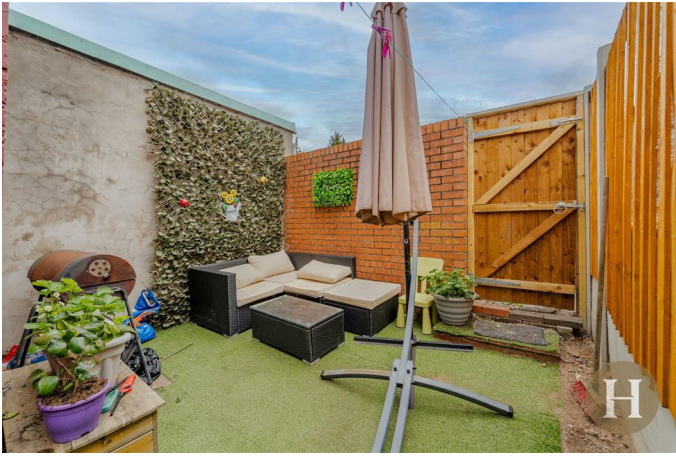
Rear patio area, with a range of fenced and wall boundaries. Additional garden area to rear via gate.